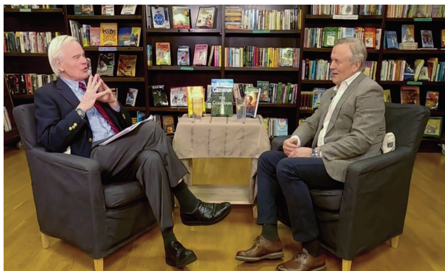
ABOVE: John Grisham discusses The Guardians on a Bookwatch program recorded at Flyleaf Books in Chapel Hill.