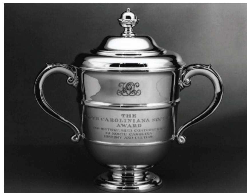
ABOVE: The original cup is in the North Carolina Collection at UNC-Chapel Hill's Wilson Library.